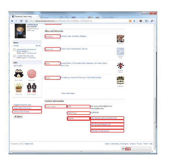
Fig. 6: FacePalm's policy and its visualization on a Facebook page.