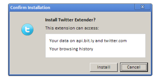
Fig. 2: A fragment of Twitter Extender's manifest and the dialog that prompts a user for access privileges when the extension is installed

"background_page": "background.html", "permissions": [ "tabs", "http://api.bit.ly/" ]